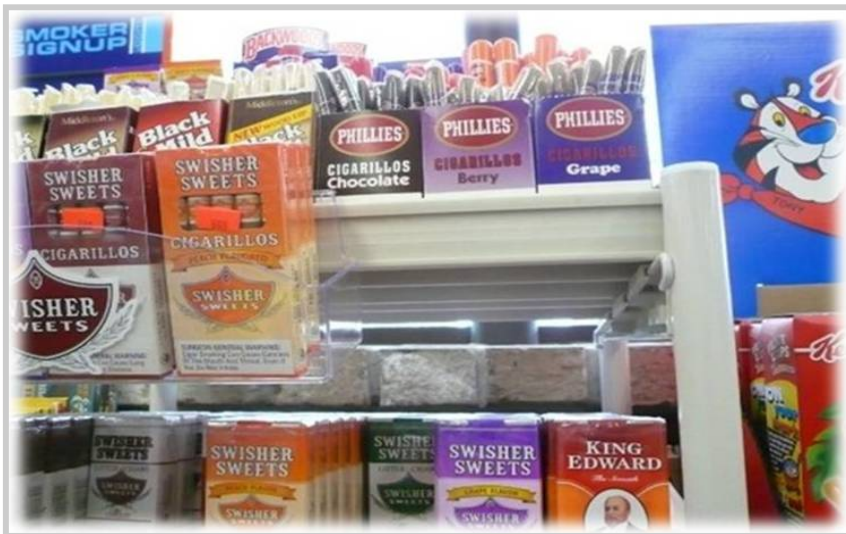
Example of flavored tobacco products placed adjacent to children's breakfast cereals in a convenience store in southwest Minnesota.