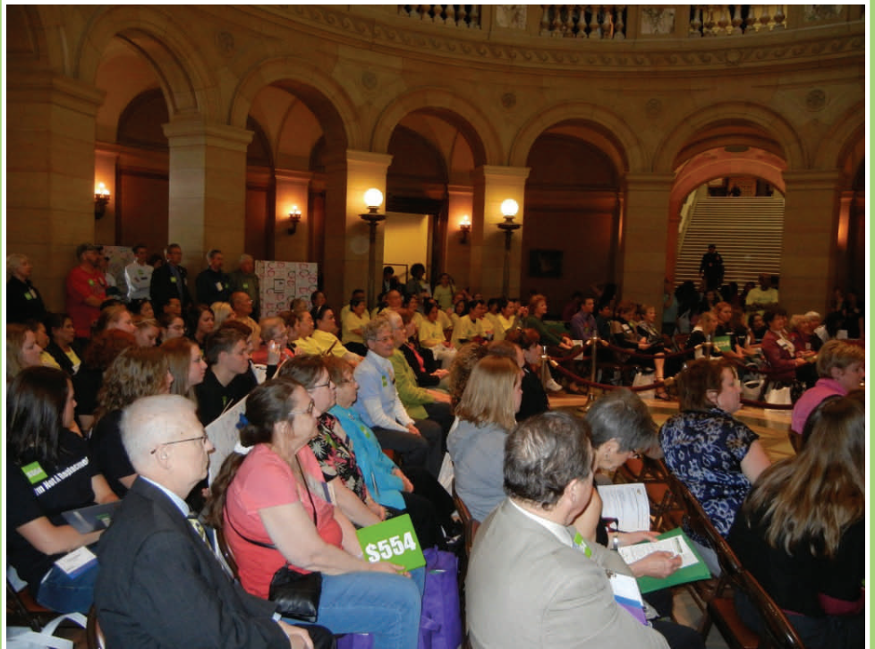
Nearly 400 advocates from all over Minnesota gathered at the State Capitol on April 7. One of the highlights of the day was a rally in the Rotunda.

Tobacco kills over 5,000 Minnesotans each year. A $1.50 per pack increase in the price of cigarettes in Minnesota would keep 60,000 kids from starting to smoke and help 29,000 current smokers to quit.