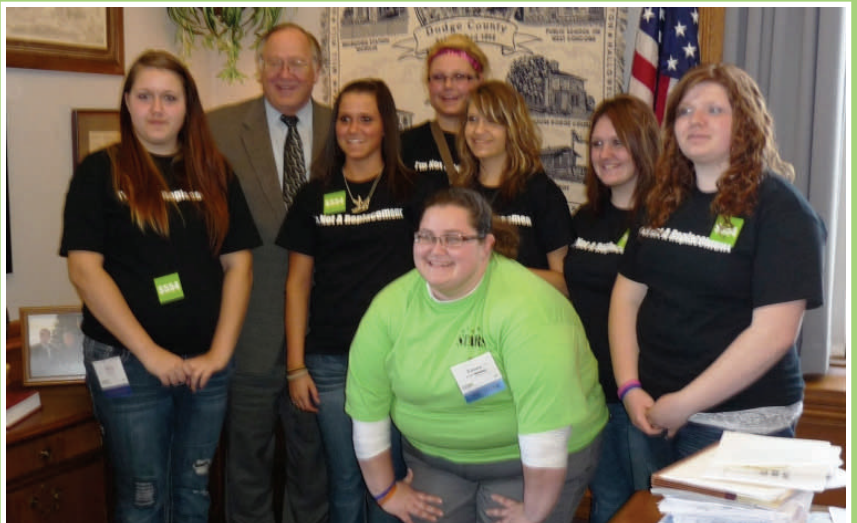
Students from the SADD (Students Against Destructive Decisions) programs at Kasson-Mantorville and Triton high schools met with Senator David Senjem.