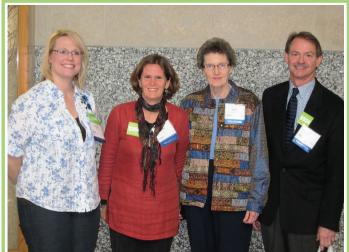
Coalition members from Faribault and Northfield.

The figure $554 was seen everywhere on buttons and signs during the Day at the Capitol. A recent study showed that treating disease caused by tobacco use cost Minnesota a staggering $2.87 billion for just one year. Divide this amount by the total population of our state and it works out to an added cost of $554 per year for every man, woman and child. We have made good progress in Minnesota to reduce the harm caused by tobacco, but clearly there is still a lot of work to be done. We all continue to pay the price for tobacco.