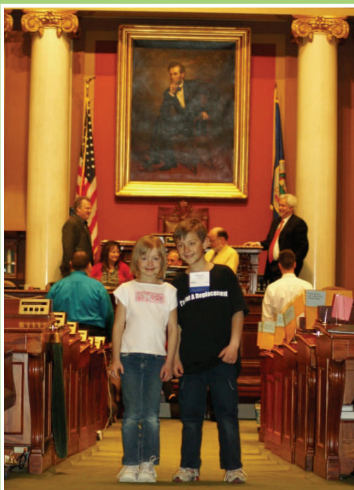
Two future legislators from our group were given permission to step inside the House chamber.